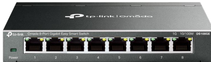
8 × Gigabit RJ45 Ports